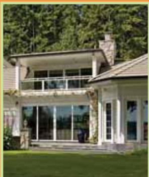
Roof Detail Areas Under Self-Adhered Cap Sheet