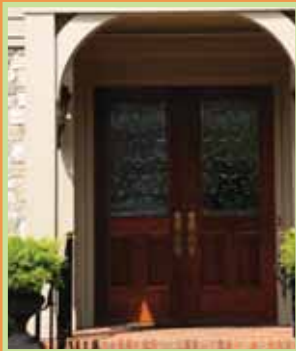
Doors frame and Jamb