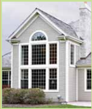
Windows Header, Sill and Jamb